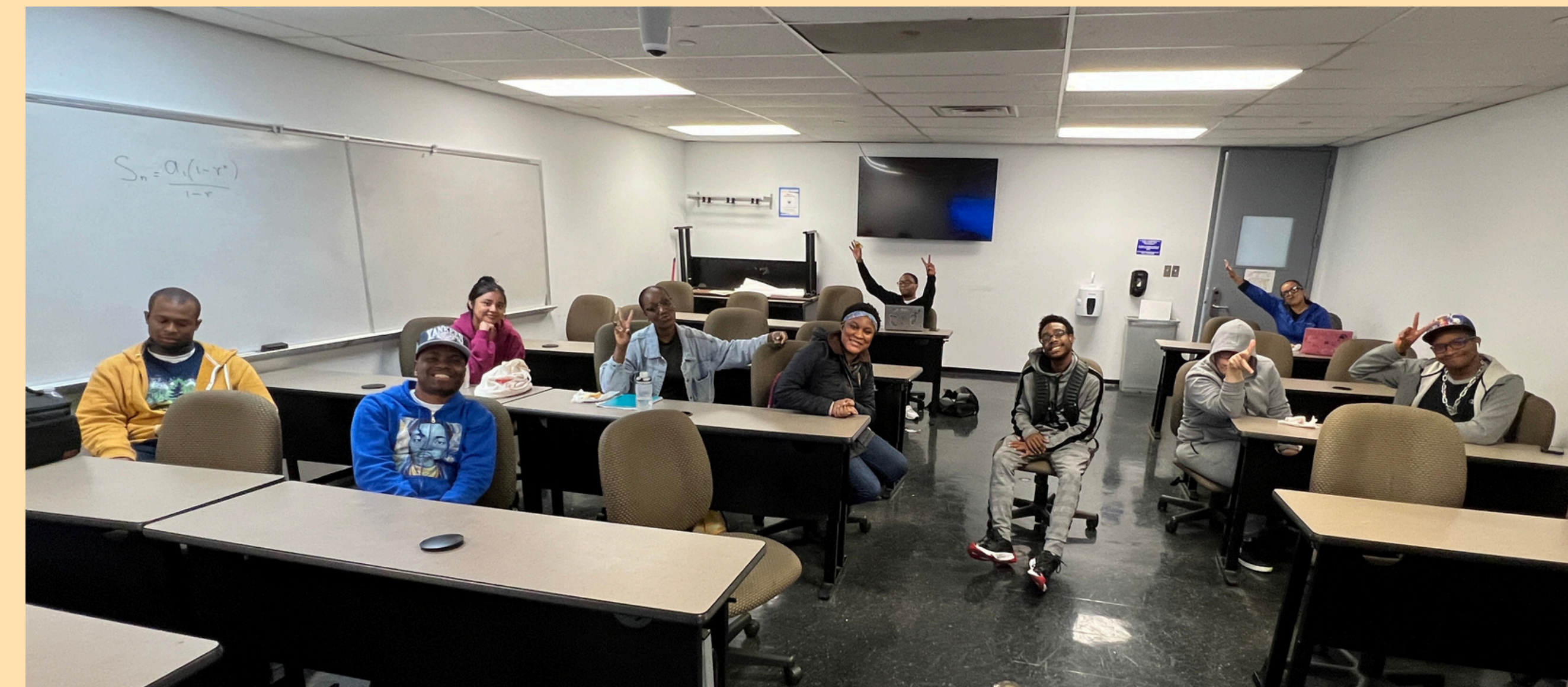
Hostos Community College class